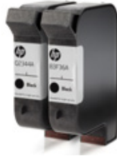
HP 1918 Dye-based Black Print Cartridge