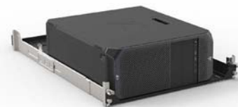
Figure 5. The HP Z4 G4 installed in the HP Z2/Z4/Z6 Depth Adjustable Fixed Rail Rack Kit (2HW42AA)