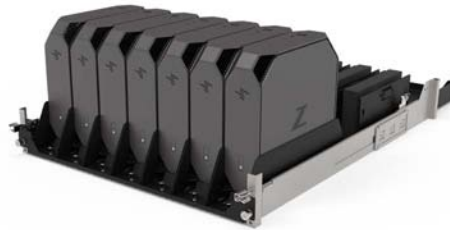
Figure 3. The HP Z2 Mini installed in the HP Z2/Z4/Z6 Depth Adjustable Fixed Rail Rack Kit (2HW42AA) using the HP Mini Chassis and ePSU Rack Mount Brackets (3RW67AA)

The HP Z2/Z4/Z6 Depth Adjustable Fixed Rail Rack Kit includes a set of fixed-rail support brackets that attach directly to the rack and provide a secure mounting platform for the system-tray and workstation. The fixed-rails are adjustable and can accommodate racks that are 24-30 inches deep. The HP Z2 Mini is installed in the vertical position and 7 Minis can fit in the 5U space.