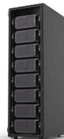
Figure 2. HP Z8 Racked