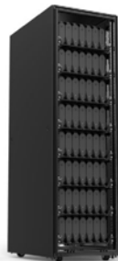
Figure 1. HP Z2 Mini G4 Racked

For the HP Z8 G4 Workstation, HP continues to offer an enterprise-class rail solution that fully extends—allowing for in-rack configuration of the Workstation. Gaining access to the interior components of a rack mounted HP Z8 G4 Workstation is a tool-free operation.