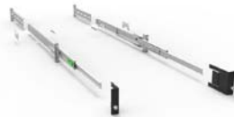
Figure 7. The HP Z640/Z840/Z8 G4 Rail Rack Kit (2FZ77AA) components

For customers looking to upgrade an existing rack mounted HP Z840, HP is offering the HP Z8 Rack Rail Upgrade Kit (2FZ76AA). The kit includes a set of inner slide rails, front flanges, and hardware necessary to perform a seamless upgrade to the new, more powerful, HP Z8 G4—all without removing rack kit hardware from the rack. Simply attach the HP Z8 Rack Rail Upgrade Kit to the HP Z8 G4, remove the HP Z840 from the rack, and replace with the configured HP Z8 G4.