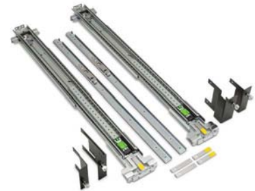
Figure 8. The HP Z8 Rack Rail Upgrade Kit (2FZ76AA) components