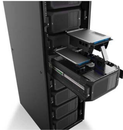
Figure 6. A Rack Mounted HP Z8 G4 installed with an HP Z640/Z840/Z8 G4 Rail Rack Kit (2FZ77AA) showing access to interior Workstation components

The HP Z640/Z840/Z8 G4 Rail Rack Kit rails installs into racks without using tools, making setup convenient and efficient. The inner slide and mounting flanges attach to the computer chassis using a set of screws for added strength and stability. The top mounting holes are concealed underneath the top plastic trim, which must be removed to attach the inner slide and mounting flanges.