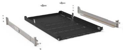
Figure 4. The HP Z2/Z4/Z6 Depth Adjustable Fixed Rail Rack Kit (2HW42AA) exploded view

The HP Z2/Z4/Z6 Depth Adjustable Fixed Rail Rack Kit (2HW42AA) includes a set of fixed-rail support brackets that attach directly to the rack and provide a secure mounting platform for the system-tray and workstation. The fixed-rails are adjustable and can accommodate racks that are 24-30 inches deep. The system-tray is engineered to provide tool-free access to the workstation, allowing the workstation to be serviced without removing it from the rack.