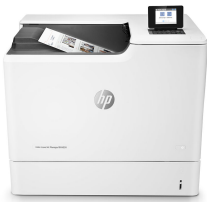
HP Color LaserJet Managed E65050dn

HP Managed MFPs are optimized for managed environments. Offering increased monthly page volumes and fewer interventions, this product can help reduce printing and copying costs. See your HP Authorized Reseller for details.