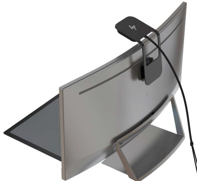
*Display not included

Turn your display 1 and Windows 10 PC into a versatile capture tool with the HP Z 3D Camera. The display-mounted, down-facing camera quickly digitizes 3D objects and textures, 2D documents, and the live desktop view.