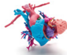
Data courtesy of FreshFiber