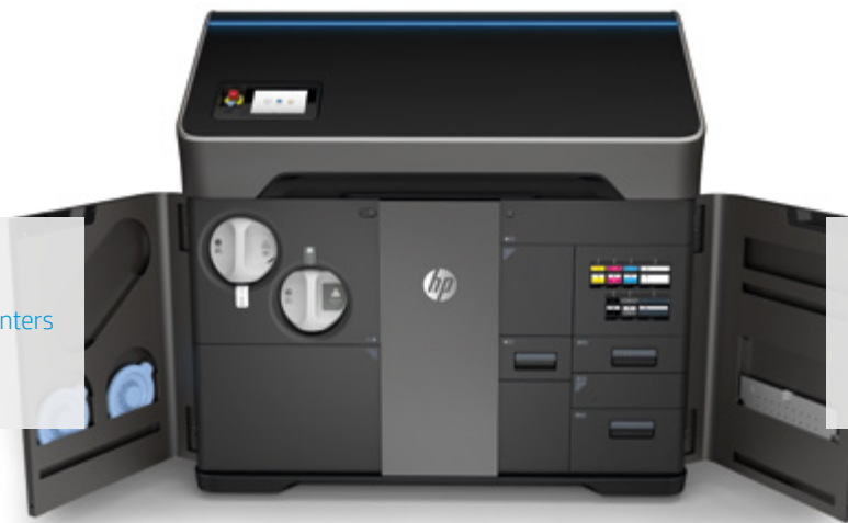
Image shows the HP Jet Fusion 580 Color 3D Printing Solution

HP Jet Fusion 540/340 3D Printers 4-agent configurability