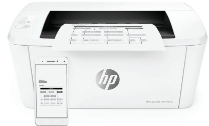
HP LaserJet Pro M15w Printer