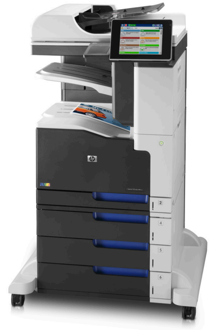
HP LaserJet Enterprise 700

Results revealed frequent, and at times substantial, differences in the emissions profiles of printers using OEM toner cartridges and the same printers using non-OEM cartridges. Altered performance parameters, when testing with non-OEM toners, occurred in all categories tested, ranging from different chemical substance emissions to variations in the particle release behavior of the devices. A summary of the non-OEM cartridge tests results that exceeded the Blue Angel substance emission limits is shown in Figure 1.