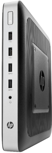
HP t630 Thin Client