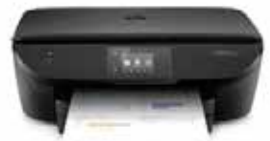
1,700 Points HP ENVY 5660 e-All-in-One Printer F8B04A