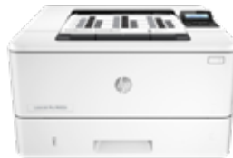
3,250 Points HP LaserJet Pro M402n Printer C5F93A