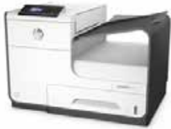
6,800 Points HP PageWide Pro 452dn Printer D3Q15A

Don't forget that you earn one point for every $4 USD 1 your organization spends on qualified Original HP ink or toner, or Samsung cartridges and you earn additional points for recycling HP cartridges with HP Planet Partners. Plus, earning points is hassle-free. Because once you make a purchase, we follow up with PurchasEdge for you to make sure you get the points you've earned!