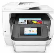
5,450 Points HP OfficeJet Pro 8740 All-in-One Printer K7S42A