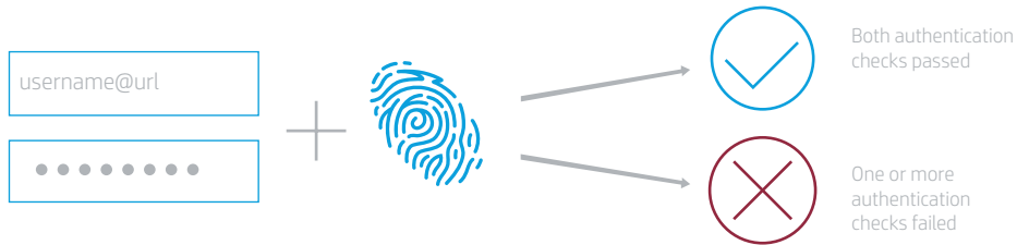
Figure 1. Combining two methods of authentication makes it much harder for attackers to steal identities. For example, admins can configure HP Client Security Manager to require users to input something they know (such as a password) and provide something they are (such as a fingerprint) for strong identification security.