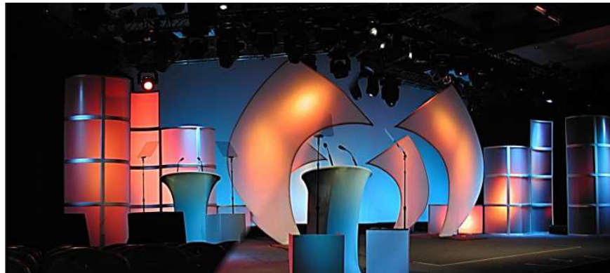
Figure 2: Example of a Tensioned Fabric Display

As an added benefit, the processes involved with producing soft signage are not markedly different from more traditional printing processes, so there's no steep learning curve associated with producing these applications. Although textiles and fabrics require more sophisticated inks, substrates, and printers, new technologies are making it easier than ever to address these requirements. Today's water-based and non-toxic inks address consumer, corporate, and governmental requirements for environmentally-friendly supplies and processes. Latex inks are quite versatile, featuring lower levels of volatile organic compounds (VOCs) in relation to solvent-based inks. Furthermore, ink curing and adhesion