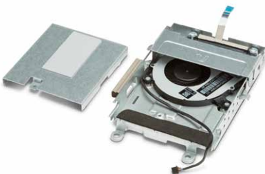
HP G4 Mini 2.5-inch SATA Drive Bay Kit