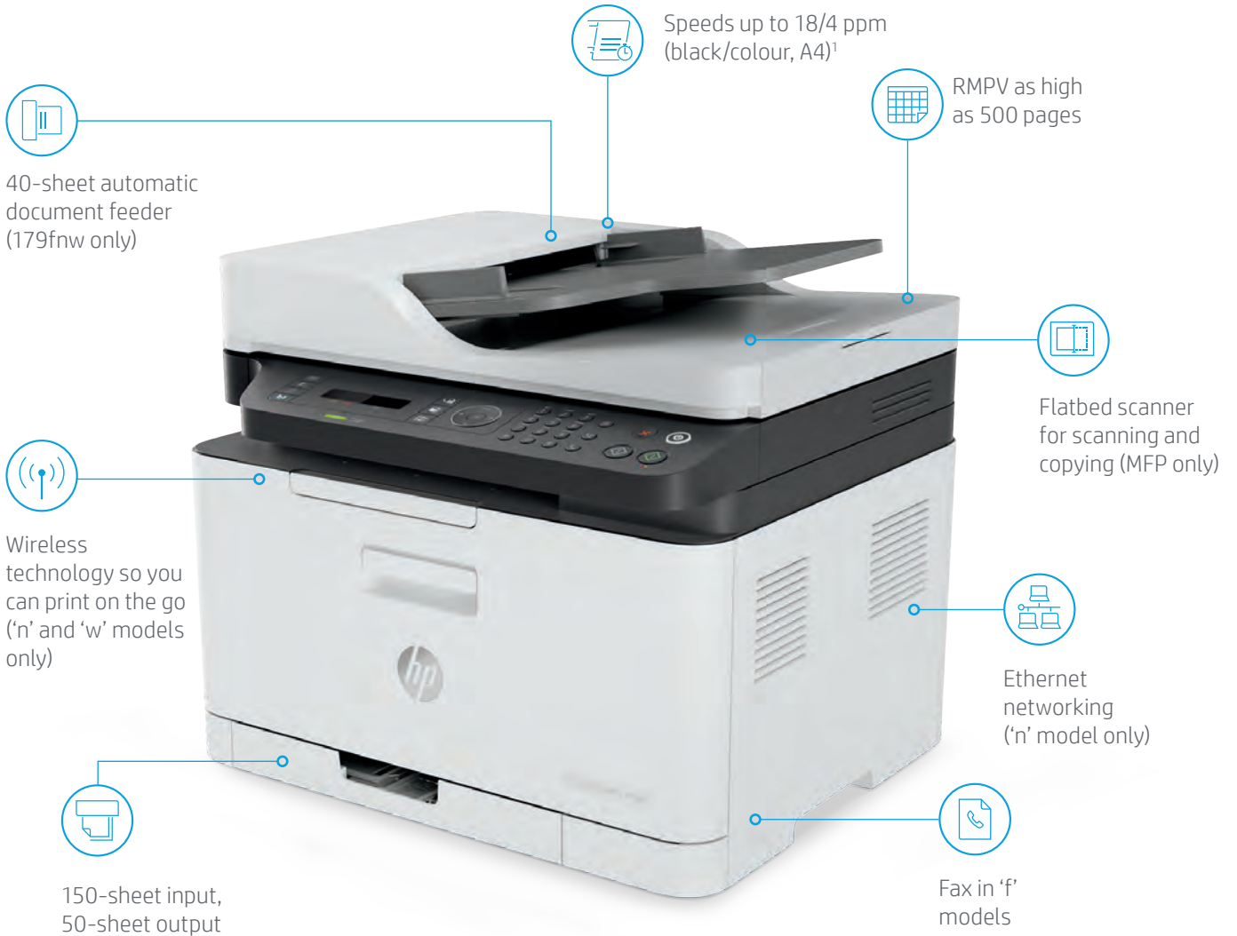
HP Color Laser 150a HP Color Laser 150nw