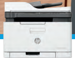
HP Color Laser MFP 179fwn