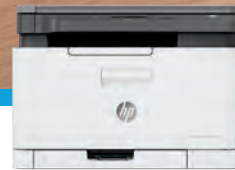
HP Color Laser MFP 178nw