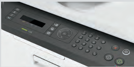
Intuitive control panel for ease of use