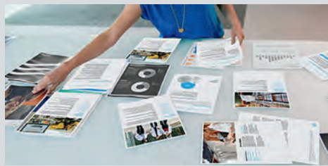
Crisp color graphics for business documents