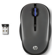
HP X3300 (Gray) Wireless Mouse H4N93AA