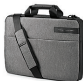
HP 15.6 Signature Slim Topload Case L6V68AA