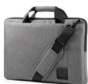
HP 15.6 Slim Topload G8Y15AA