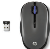
HP X3300 (Gray) Wireless Mouse H4N93AA