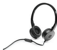
HP H2800 Black Headset J8F10AA