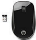
HP Z4000 Black Wireless Mouse H5N61AA