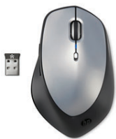
HP X5500 Wireless Mouse H2W15AA