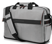
HP 15.6 Trend Topload Case L6V62AA