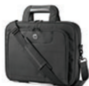
HP Value Top Load 16.1-inch Case QB681AA