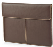
HP 13.3 Leather Sleeve F3W21AA