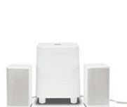
HP 2.1 White S7000 Speaker System K7S76AA