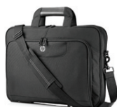
HP Value Top Load 18-inch Case QB683AA