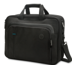
HP 15.6 SMB Topload Case T0F83AA