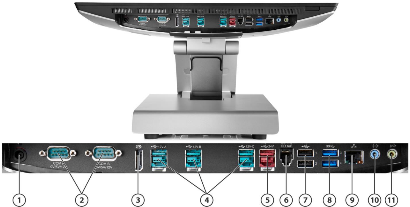
Image shown with ergonomic stand