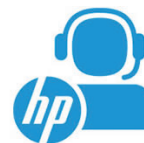
HP Smart Friend 1 Month SVC HG382E

© Copyright 2015 HP Development Company, L.P. The information contained herein is subject to change without notice. The only warranties for HP products and services are set forth in the express warranty statements accompanying such products and services. Nothing herein should be construed as constituting an additional warranty. HP shall not be liable for technical or editorial errors or omissions contained herein. Not all features are available in all editions or versions of Windows. Systems may require upgraded and/or separately purchased hardware, drivers and/or software to take full advantage of Windows functionality. See http://www.microsoft.com . All other trademarks are the property of their respective owners.