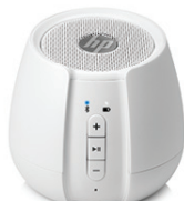
HP White S6500 Wireless Speaker N5G10AA