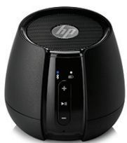
HP Black S6500 Wireless Speaker N5G09AA