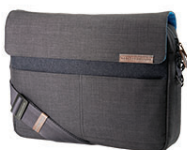
HP Premium Messenger J4Y51AA