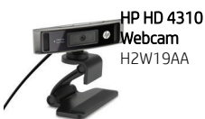
HP HD 4310 Webcam H2W19AA