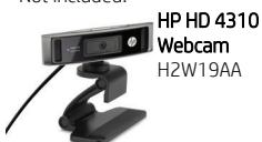
HP HD 4310 Webcam H2W19AA