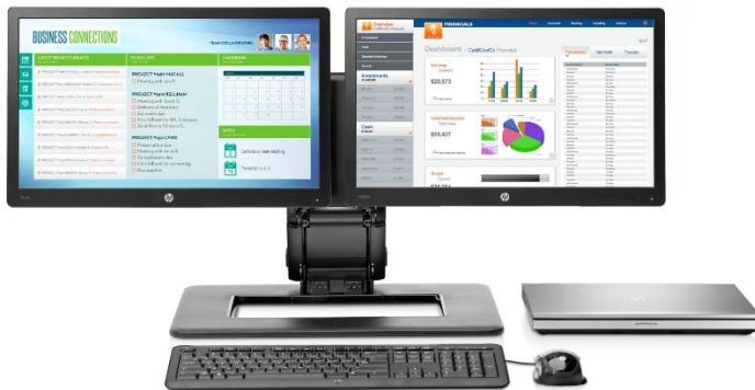
HP ProDisplay P223 and HP Adjustable Dual Display Stand dual monitor configuration shown. (Note: monitors and stands sold separately)

Your ideal office configuration begins with two HP ProDisplay P223 monitors combined with an HP Adjustable Dual Display Stand (AW664AA) for a small footprint, high productivity work solution.*