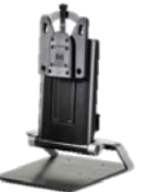
Integrated Work Center