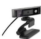
HP HD 4310 Webcam Y2T22AA