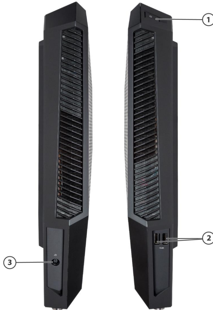
HP Z VR Backpack G1, left side and right side view