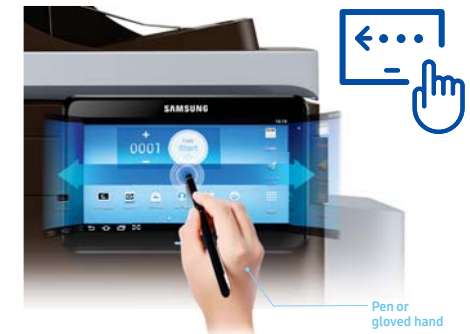
Pen or gloved hand

The SMART MultiXpress M5360RX comes equipped with an interactive 7-inch IR type touch screen panel to access the Smart UX Center. It provides a high degree of smart functionality, ease-of-use, and customizability. It also boasts exceptional sensitivity, letting users easily take advantage of all the features even when operating with a pen or gloved hand.