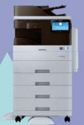
Second Cassette Feeder+ Short Stand