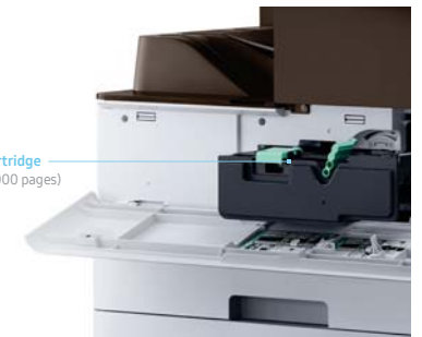
Toner Cartridge (Max 30,000 pages)

Reduces labor costs for heavy printing with ultra-high-yield toner cartridges and drums. Samsung genuine toner lowers your TCO with a yield of 30,000 standard B&W pages and drums that yield 100,000. Made for Samsung printers, Samsung genuine toner delivers exceptional print quality and less paper waste.