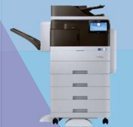
Inner Finisher (1-Bin) + Second Cassette Feeder+ Short Stand