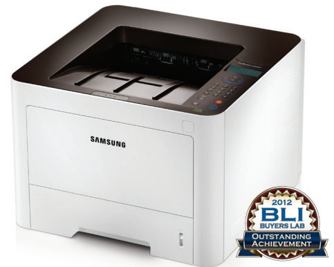
Outstanding Achievement in Innovation: Samsung Easy Eco Driver