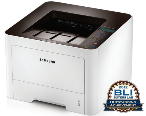
Outstanding Achievement in Innovation: Samsung Easy Eco Driver