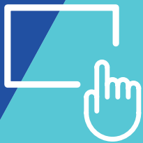
7" Touchscreen LCD (Capacitive Type)