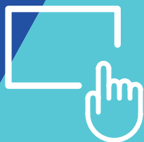
7" Touchscreen LCD (Capacitive Type)