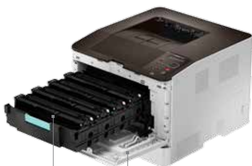
Toner Cartridge (Colour : 8,000 pages Mono : 5,000 pages) Front Cover