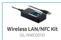
Wireless LAN/NFC Kit (SL-NWE001X)