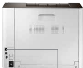
Power Connector USB Port Network Port