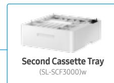
Second Cassette Tray (SL-SCF3000)w