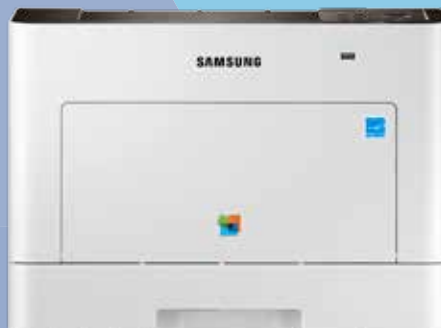
C3010ND (30 ppm)