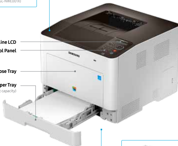
2-line LCD Control Panel Multipurpose Tray Paper Tray (250-sheet capacity)