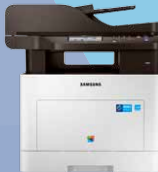
C3060FR (30 ppm)