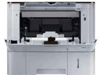
Toner Cartridge Front Cover