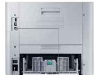
Power Connector USB Port Network Port