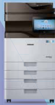
K4350LX (35 ppm)