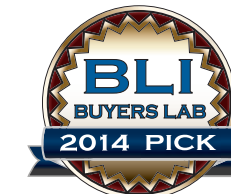
MultiXpress CLX-8650 Outstanding A4 Color MFP for Large Workgroups