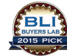
MultiXpress X4300LX Outstanding 21- to 30-ppm A3 Color MFP