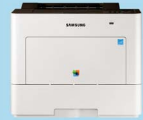
C4012ND* (40 ppm)