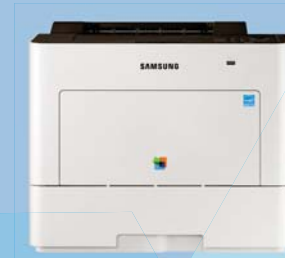
C4010ND (40 ppm)