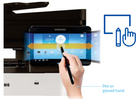
Pen or gloved hand