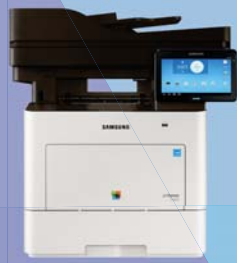
C4062FX* (40 ppm)

*Only available in North and Latin America