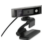
HP HD 4310 Webcam H2W19AA