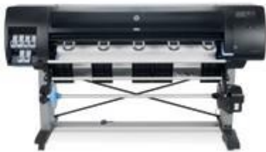
HP DesignJet Z6600 Production Printer

F2S72B#BCB—HP DesignJet Z6800 60-in Photo Production Printer w/ Encrypted HDD