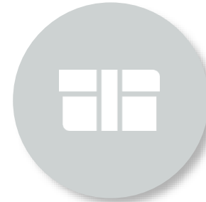
HP Long Term Consumables

Access to HP experts who will quickly troubleshoot your 3D printing system, to help return the hardware to full-operating condition within a specified timeframe.