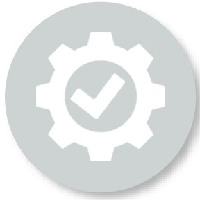
HP Ready to Print Service