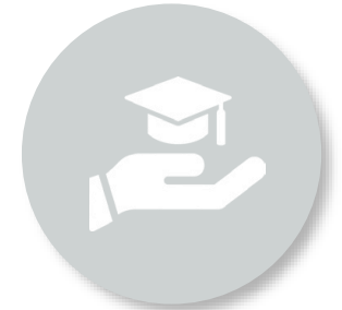
HP Advanced Operation Training