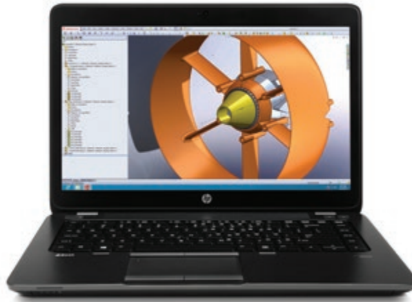
HP ZBook 14 Mobile Workstation

Deliver your best work on the go using the world's first workstation Ultrabook™ 1