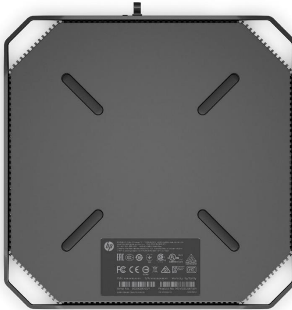
HP Z2 G5 Mini, bottom view

Removable bottom feet for access to integrated VESA mounting holes